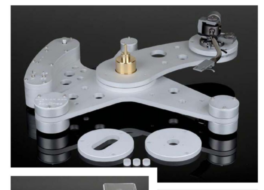
Above: The Soulines Kubrick DCX, seen without its platter (but with its extra armboards). Left: The same turntable, with platter and dustcover.

The icing on the cake was that all five Soulines models came with a cleverly designed, minimalist dustcover, and each turntable was fancifully named for a famous individual: two composers, one novelist, one film director, and one Greek god—respectively, Elgar, Satie, Dostoyevsky, Kubrick, and Hermes. These elements, and the fine sound produced at NYAS 2015 by Soulines-fronted systems—this was in the suite sponsored by retailer Adirondack Audio & Video,